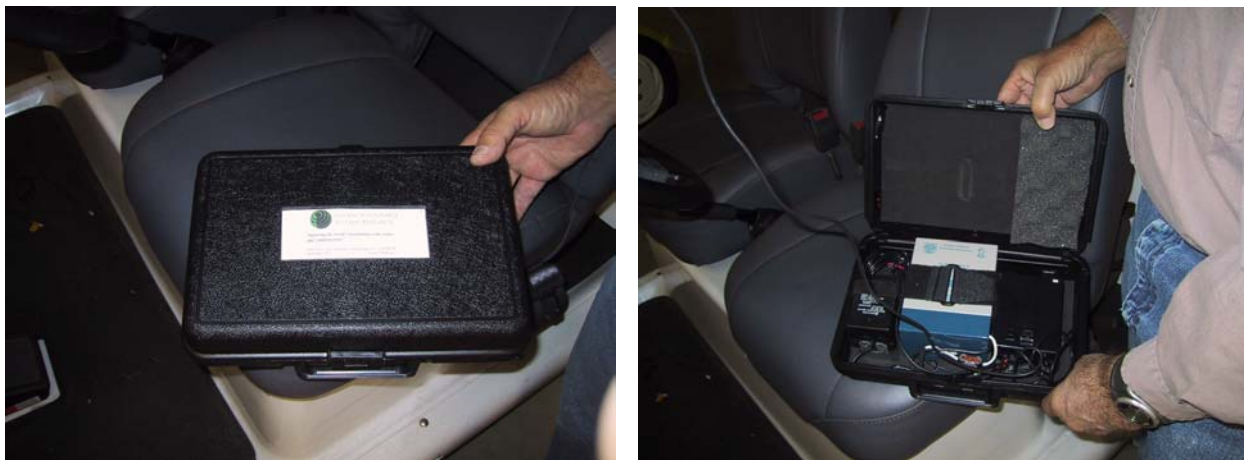
Figure III.2 CGPS Unit

Figure III.2 shows a typical CGPS unit. They weigh about 5.5 kilograms each and can be strapped to the back of a 2-wheeler or placed on the seat of a passenger vehicle. An antenna is required. In the case of 2-wheelers, 3-wheelers, and buses some experimentation may be required to find a suitable location for the antenna. The antenna is magnetic and will stick to the roof of automobiles easily. In the case of buses with fiberglass roofs, 2-wheelers, and 3-wheelers tape or other attachment means may be necessary. The antenna may be taped to the top of the CGPS box, the bus roof, or may be attached to the helmet of the 2-wheeler operator.