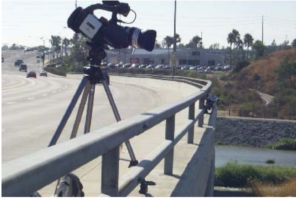
Camera Setup on the Overpass