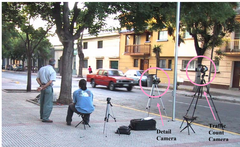
Figure IV.1 Cameras Collecting Data on a Residential Roadway in Santiago, Chile

Data is collected on the same roads and at the same times when driving patterns are being collected. This allows driving speeds and patterns determined from the CGPS units (discussed earlier in this paper) to be correlated with traffic counts taken from the digital video cameras. Thus, selection of roadways, as discussed in Section II, should consider the video taping requirements as well.