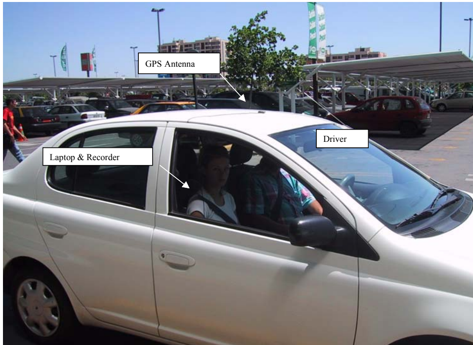
Figure III.1: GPS Instrumented Vehicle in Santiago, Chile

partners should identify up to six 2-wheelers and drivers to participate in this study 4 . Figure III.1 shows a passenger vehicle equipped with a GPS module as used in Santiago, Chile. The CGPS units do not require an operator or laptop computer. Thus, only the driver is necessary.