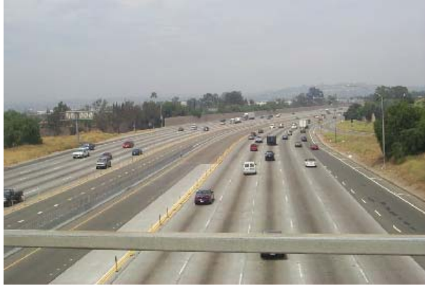
Picture of the Freeway Below