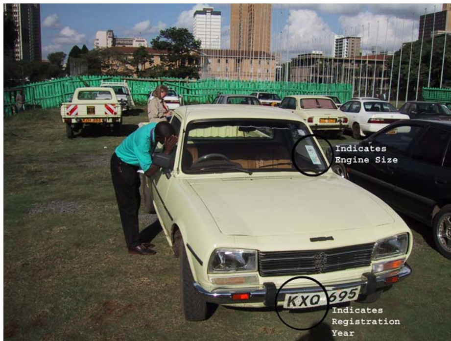
Figure V.1: Parking Lot Data Collection in Nairobi, Kenya

The on-road technology identification process using digital video cameras does not collect all of the information required to completely identify the vehicle. Therefore, it is important to supplement this data by visual inspection of parked vehicles using on-street and parking lot surveys. Figure V.1 shows data collection in a Nairobi parking lot. By use of an experienced mechanic recruited from the local area, model year distributions, odometer (distance traveled) data, air conditioning, engine air/fuel control, engine size, and emissions control technology can be estimated for the local fleet using this type of survey technique. Studies in Los Angeles indicate that the technology distributions found in parking lots and along the street closely mirror the on-road vehicle fleet.