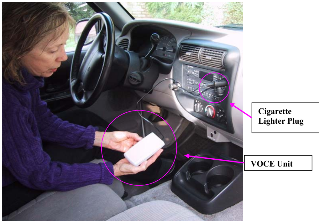
Figure VI.1 VOCE Unit for Collecting Vehicle Start Information

As noted earlier, vehicles pollute more when they are first started compared to operations when they are fully warmed up. The colder the vehicle when started, the typically greater emissions. It is thus important to know how often vehicles are started in an urban area and how long a vehicle is off between starts to make an accurate estimate of start-up emissions. CE-CERT will bring 56 Vehicle Occupancy Characteristics Enumerator (VOCE) units to measure the times that vehicles are started and how often. These VOCE units will also give us information on how long vehicles are typically operated at different hours of the day. Figure VI.1 shows one of the units in a typical application. It is normally plugged into the cigarette lighter in the vehicle and left there for up to a week at a time, collecting data all the while.